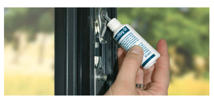
Maintenance of the fittings