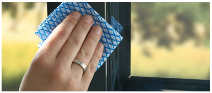
Cleaning of surfaces

Please see the technical data sheets for further information